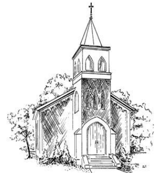
St. Stanislaus, Chatsworth Sunday 9:00 am